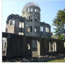
Hiroshima Peace Memorial (Genbaku Dome) (Japan)

Inside, the museum is divided into two principal sections: